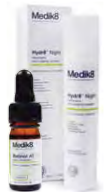
Retinol 40™ & Hydr8™ Night Vitamin A and Night Moisturiser