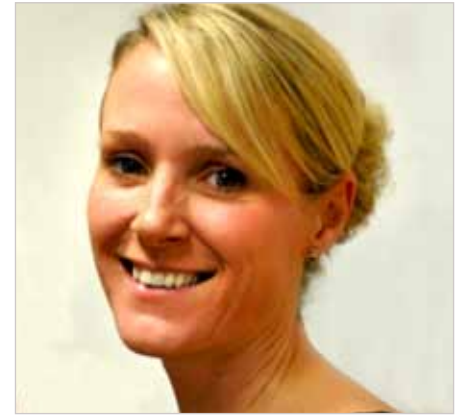
45 MINUTES AFTER TREATMENT, WITH MINERAL MAKE - UP