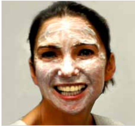
BEFORE WITH ANAESTHETIC

This will diminish greatly after a few hours following the treatment and within the next 48 hours your skin will be completely healed, and there will be barely any evidence that the procedure has taken place.