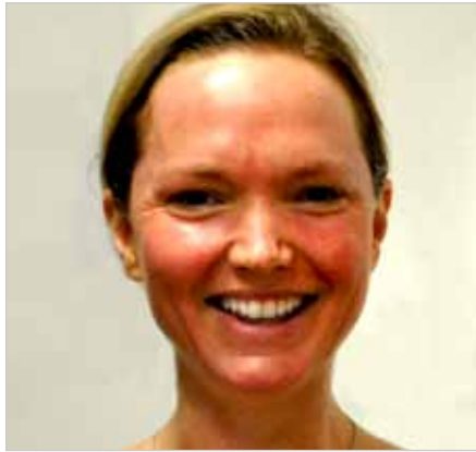
60 SECONDS AFTER TREATMENT