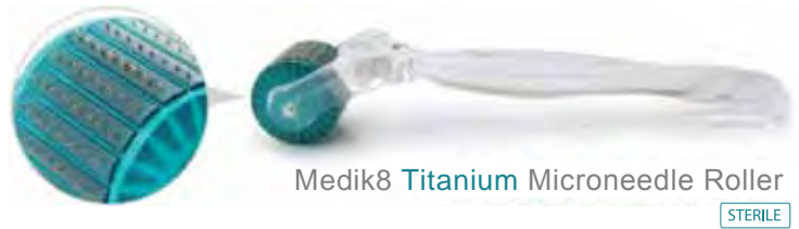
Medik8 Titanium Microneedle Roller

It is important to properly care for your skin following a treatment to optimise results. The personal use Titanium Microneedle Roller or Stamp can be used on a daily basis throughout the course of treatment to dramatically enhance product absorption and efficacy. Your practitioner will recommend a 0.2 or 0.3mm device.